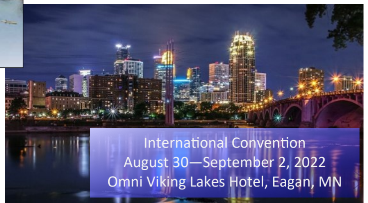
International Convention August 30—September 2, 2022 Omni Viking Lakes Hotel, Eagan, MN