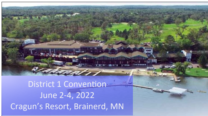
District 1 Convention June 2-4, 2022 Cragun's Resort, Brainerd, MN